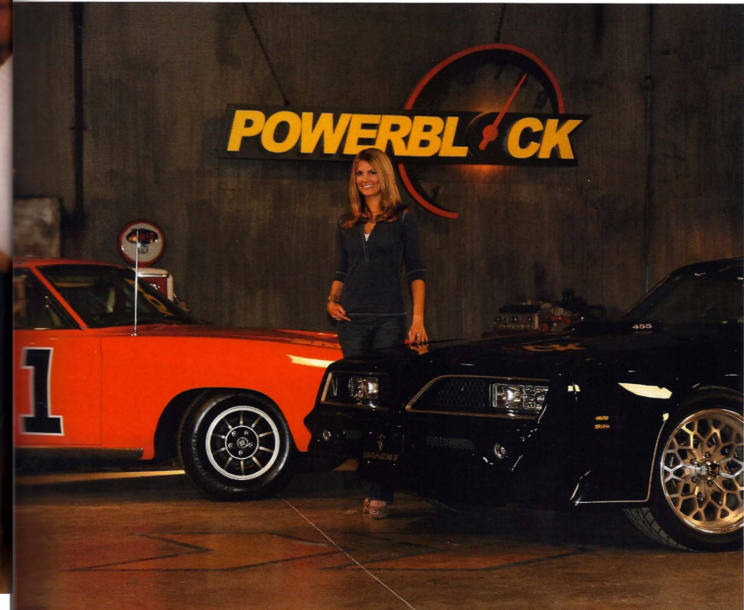
PowerBlock's host is familiar with sports cars—her dad drove them.

The future TV star also developed an early rapport with the camera. "I started modeling at about age five," she recalls. "A family friend asked me to do it, and things fell into place." A second family friend—the late movie star and avocational race driver Paul Newman—thought the lovely little girl belonged in Hollywood. "Paul Newman wanted me to be in movies, but mom